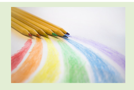
Submissions on bill banning